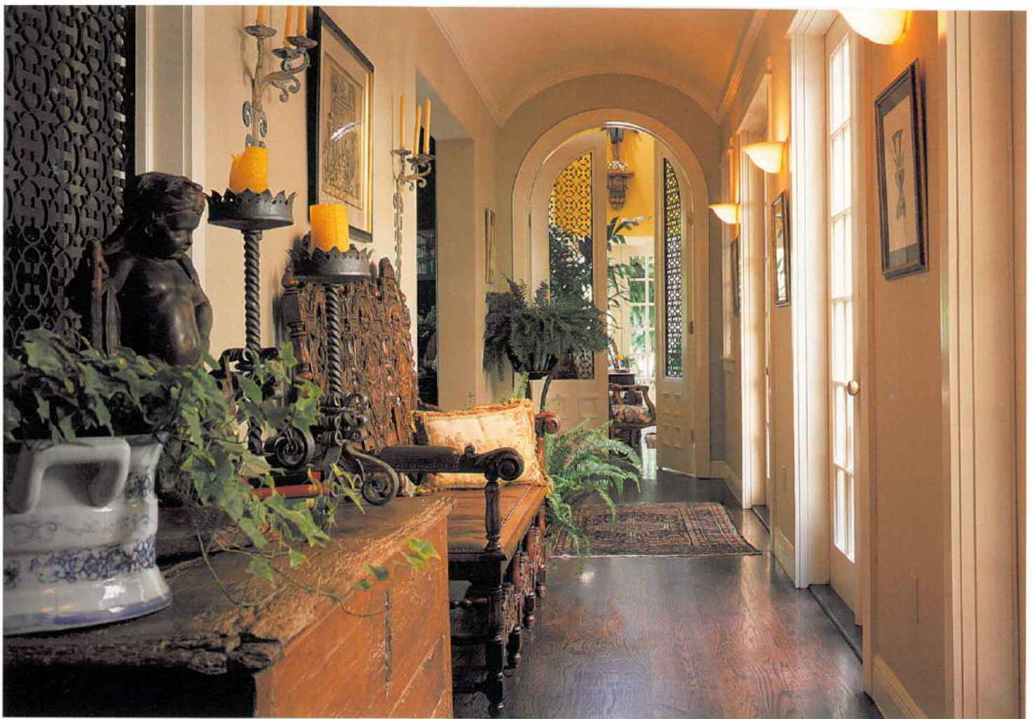
This interior gallery, one of four that secure the central courtyard, accesses the kitchen and adjoining breakfast room. All four are treated to vaulted ceilings, arched doorways and dark-stained, oak plank floors from Century Floors.