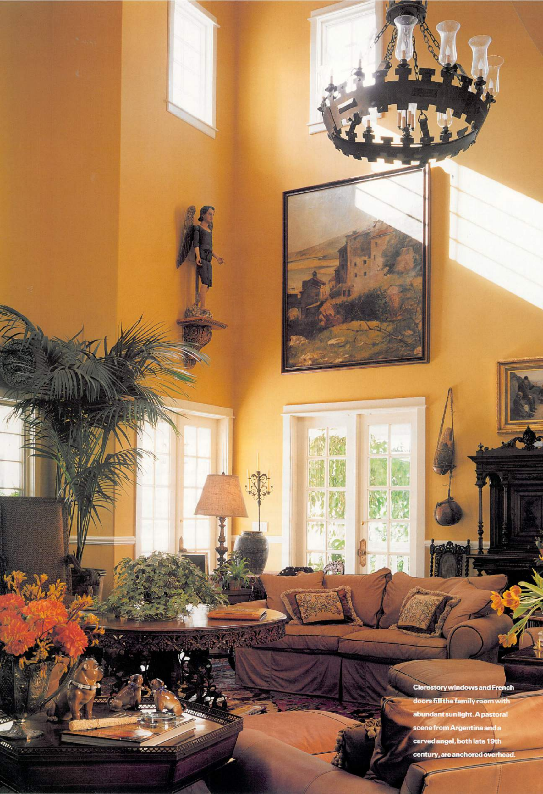
Clerestory windows and French doors fill the family room with abundant sunlight. A pastoral scene from Argentina and a carved angel, both late 19th century, are anchored overhead.